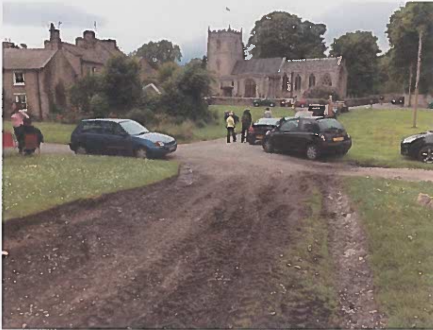
Taken on day of Rally 2016. Left – my family. Centre: Church in background, middle green in front with people sitting on green and visitors on the road (same ones from previous photo). Right – Low Green with cars parked around and on it. Right foreground – Grass out front of Hall Cottage