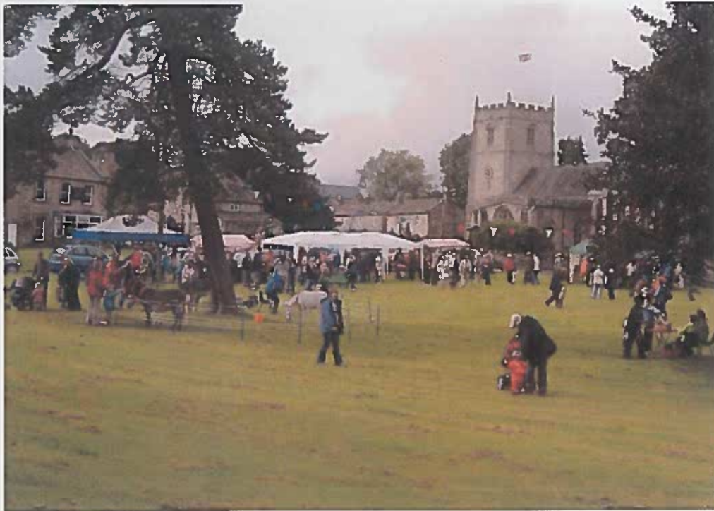
Taken by Hector Parr – 2009. Village Fair on Low Green.