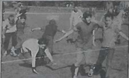
All fall down: The three-legged race