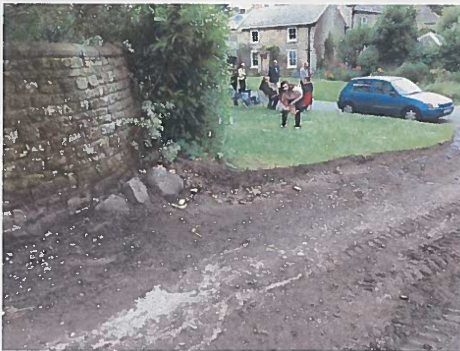
Taken on day of Rally 2016. Grass in front of our property with my family sitting on it. On road visitors using the highway to get around the village. Cottage in distance again has nothing on front despite this also being Village Green.