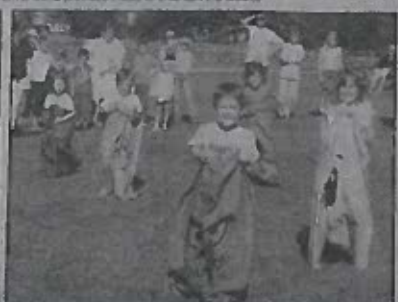
Go for it: The sack race heats up