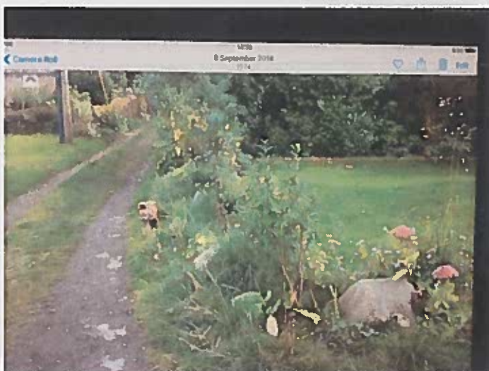
Taken September 2014 showing planting to edge of grass in front of ours