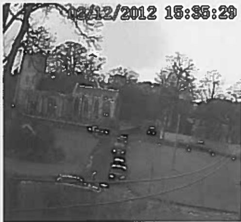
Lesley Cutting walking dog using highway