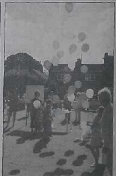
Up up and away: The start of the balloon race

Buy copies of these pictures at Mercury outlets