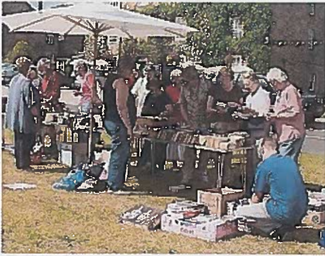
Village Fair – Taken around 2005. On Middle Green with Rose and Crown PH behind