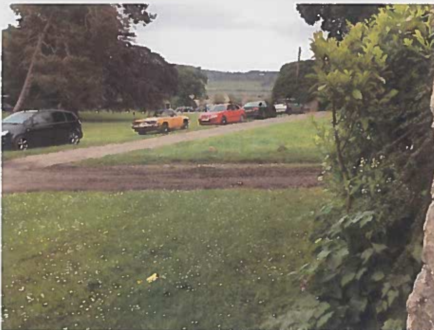
Taken day of Rally in 2016. Foreground our front leading to green in front of Hall Cottage which has nothing on despite it being Village Green. Then Low Green with cars parked on it.