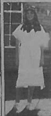
Cleopatra Photo: 5