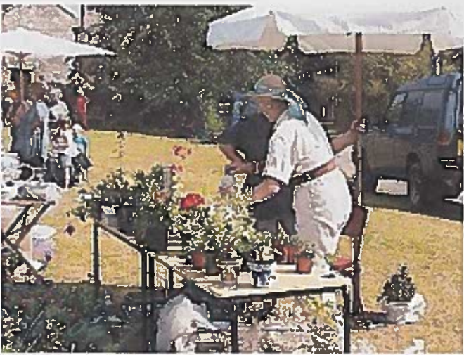
Village Fair – Taken around 2005. On Middle Green with Kirk PH in background (Left). Sennings Lane on right which leads down to Rose Stile and Rosestile Cottage.