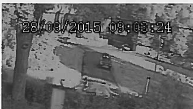
Walker using highway heading in direction of Village Hall