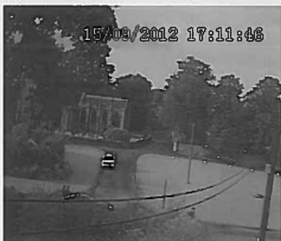
Walkers using highway