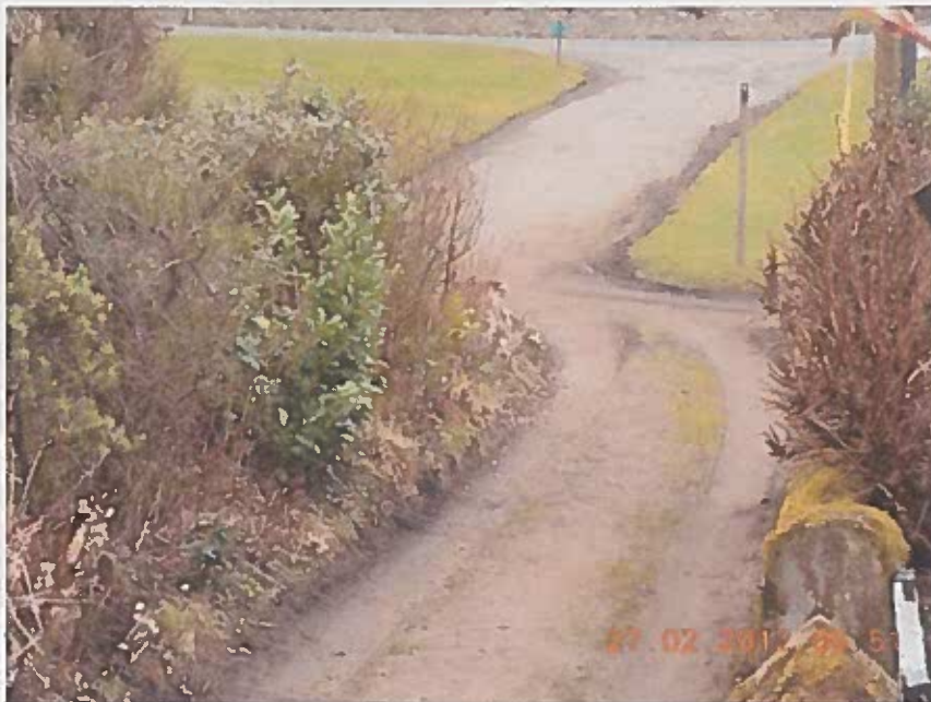
27 Feb 2011 – planting to edge of our front