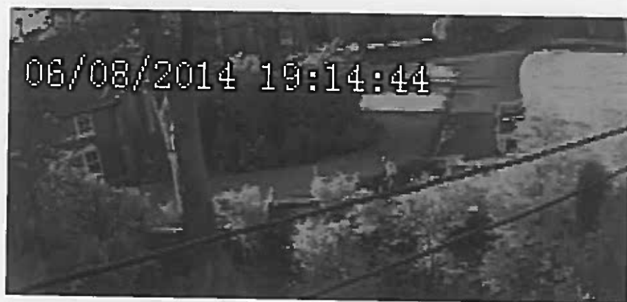
Local villager using highway