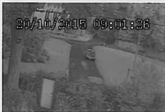
Lesley Cutting passing using highway