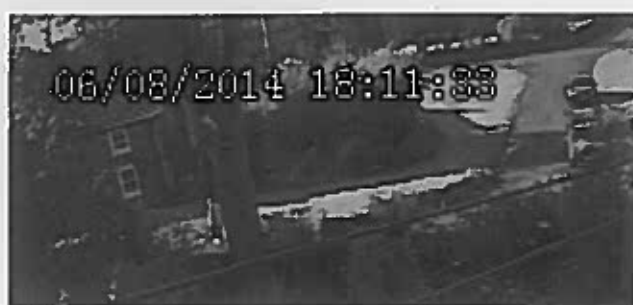
Walker using highway