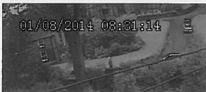
Lesley Cutting and dog using highway