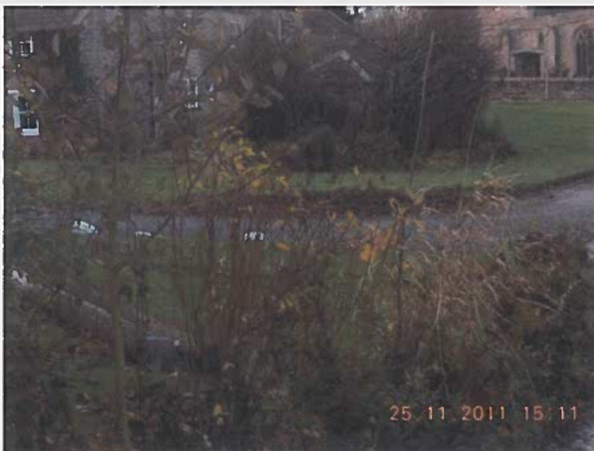
25 Nov 2011 – planting to edge of our front