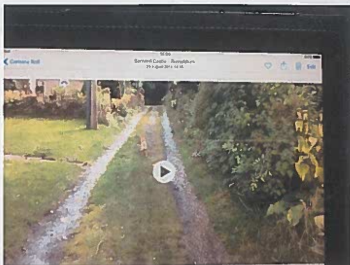
Taken August 2014 on right is planting to edge of grass in front of ours