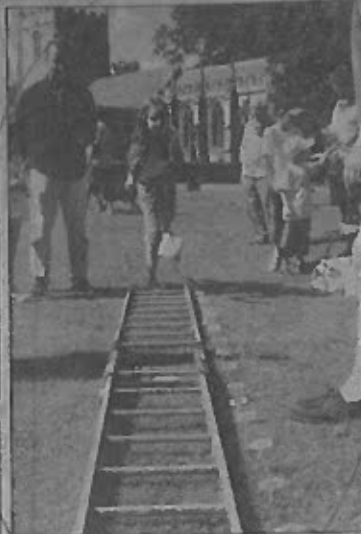
Fun and games: There were many fairground attractions, including a Saturday afternoon