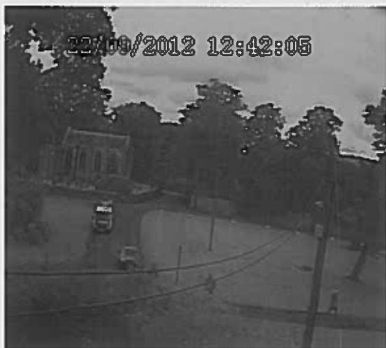
Walkers using highway in front of ours