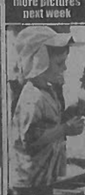
Hot days: Enjoying an afternoon