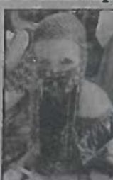
Fun time: The children had a lot of fun at the sports day