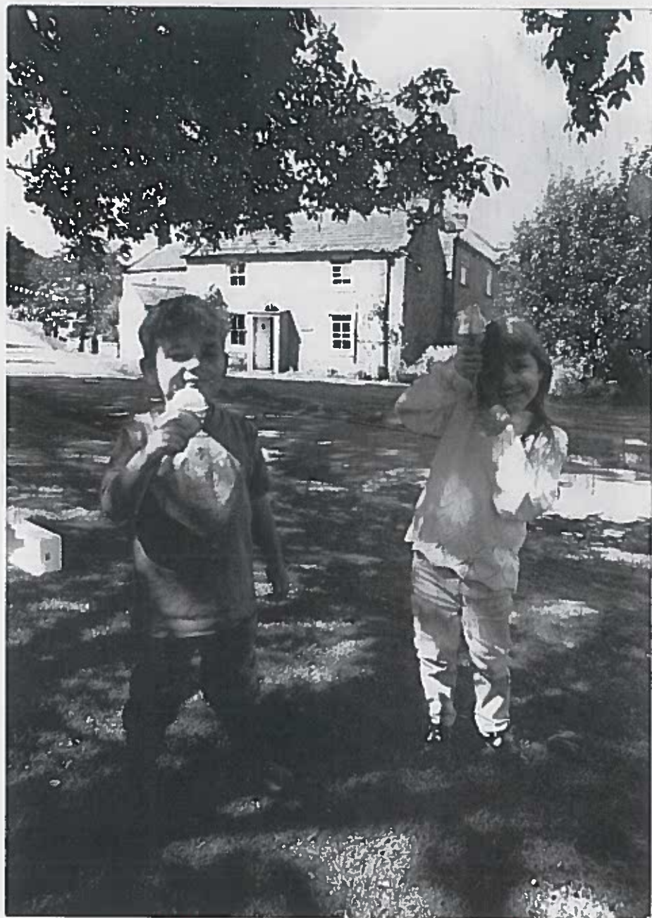
My daughter and cousin. Taken on day of Fair, approximately 1998