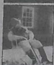
Village life: A snapshot of Romaldkirk around the village