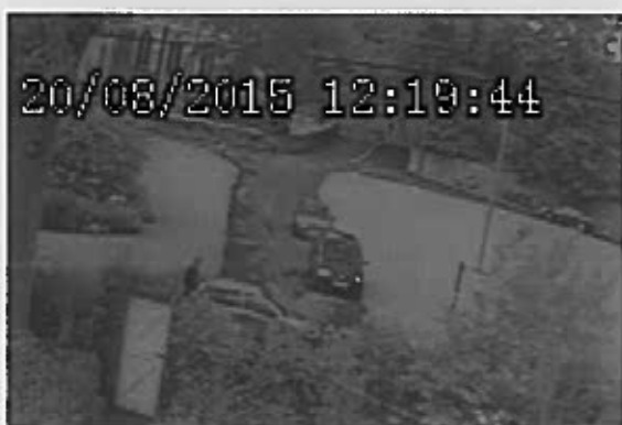
Walker on highway