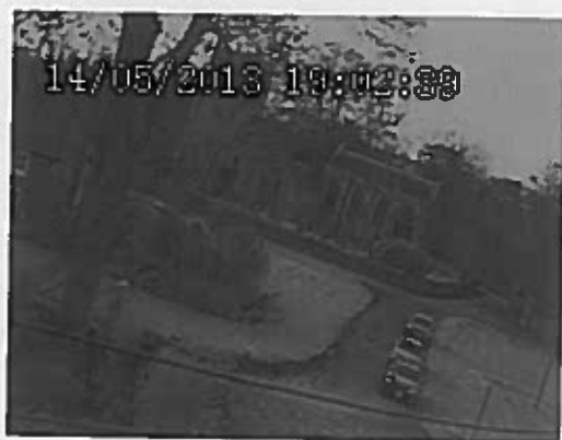
Walker on highway