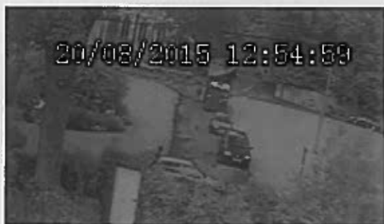
Local villager with dog on highway having come from the Lane (Teesdale Way – on right out of picture)