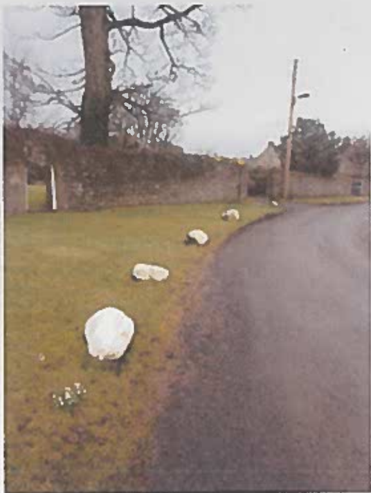
Jan 2011 – showing stones to edge of our front