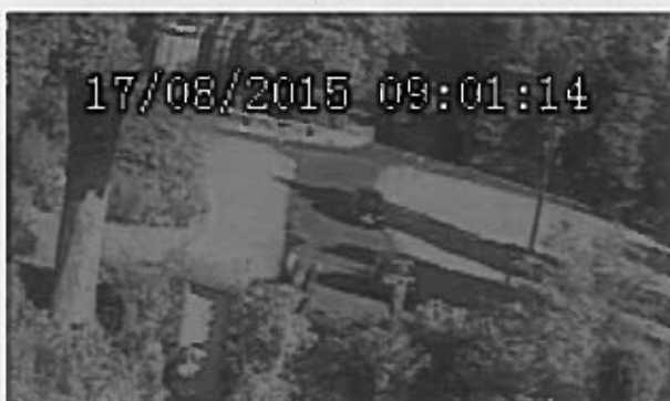
Lesley Cutting with dog, speaking with two local villagers on highway.