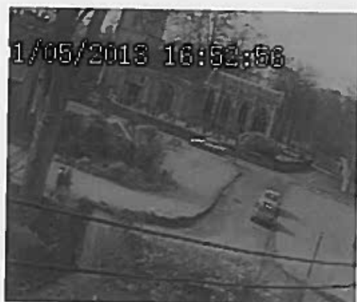
Walkers on highway