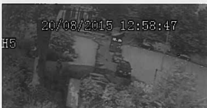
Walker using highway