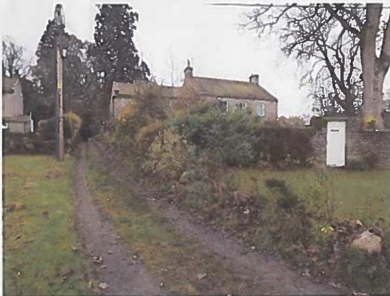
6 Nov 2014 - planting that has been removed