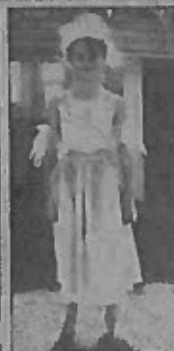
Barbie Swan Lake Photo: 3