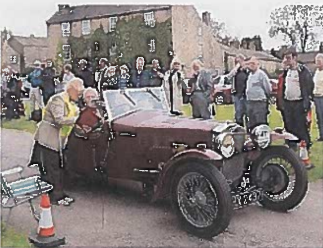
Rally in Village. Checkpoint with Rose and Crown PH and Middle Green behind