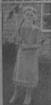
Mini Ma Mac Lally Photo: 1