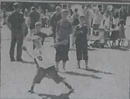
Good shot: The coconut shy proved popular