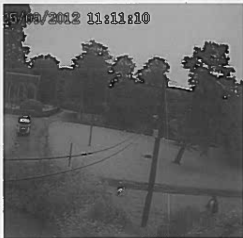
Gill Carter walks across front of Hall Cottage and then goes up Lane (see next picture)