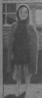
Freda Photo: 4