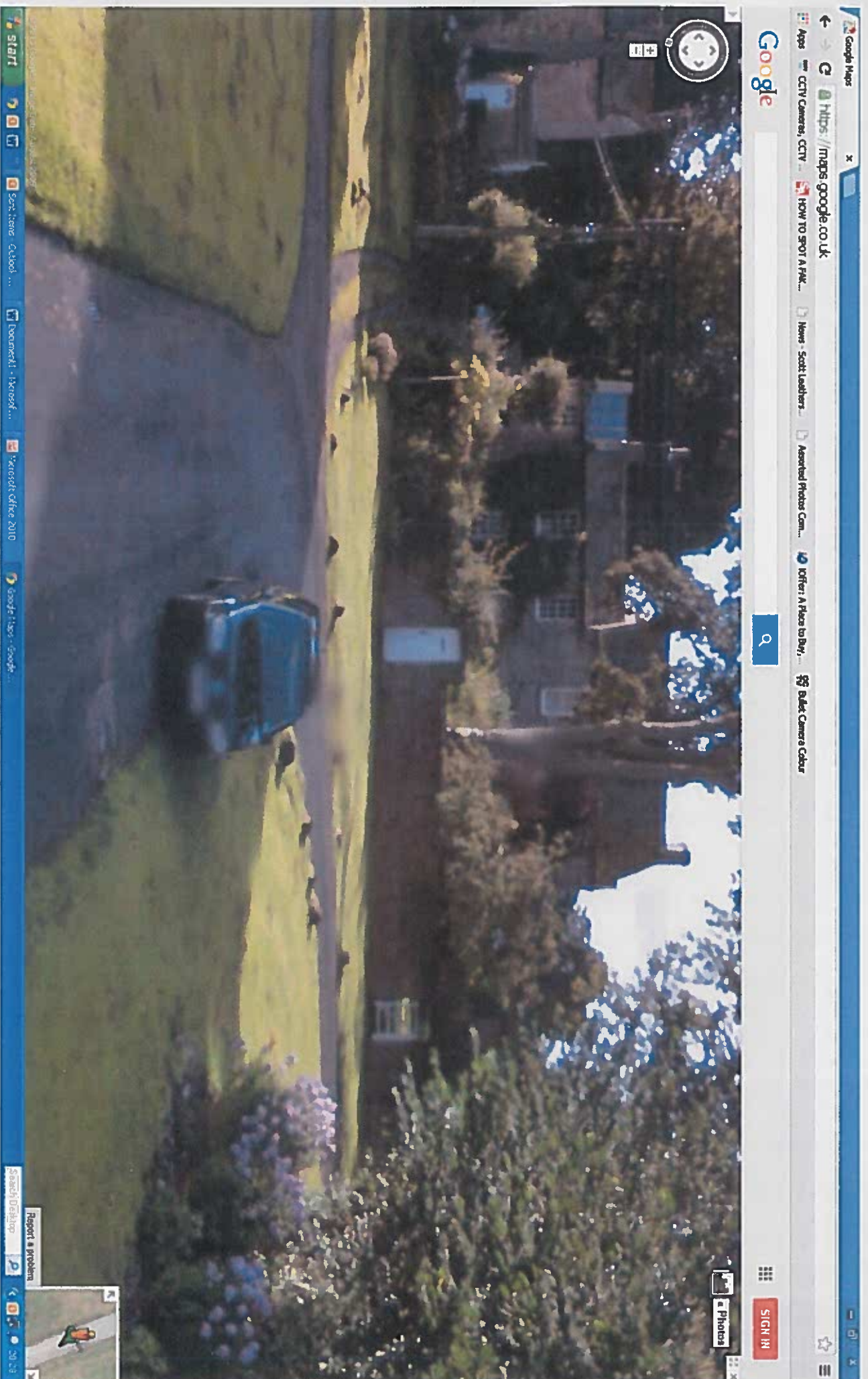
Screen shot from Google – Street View. Image Date August 2009