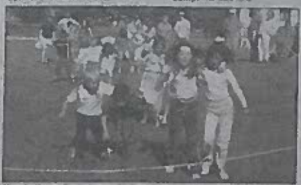
Nearly there: Competitor in the three-legged race