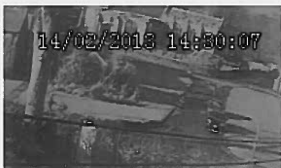
Walker with pram on highway