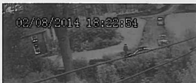
Walker using highway