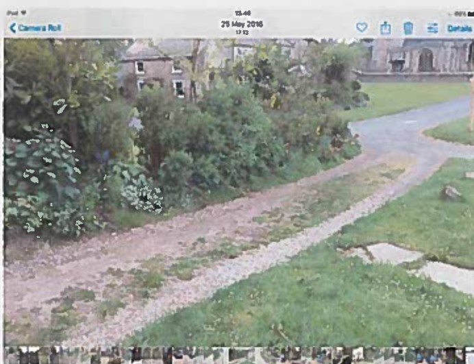
Taken May 2016 showing planting to edge of grass prior to Mrs Carter removing this illegally