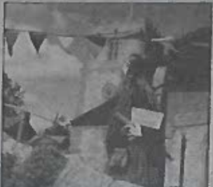
On guard: A British Airborne Corps (BA) Romaldkirk

Twenty-six villages and their organisations and several schools were reflecting village life. Also, this year was a success story with a £25,000 in the fairhouse donated to the village. The regular fall race was cancelled because of safety concerns.