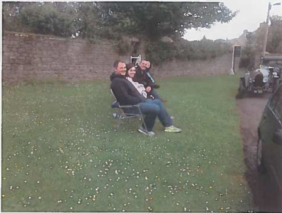
My family on our front taken on day of Rally 2016.